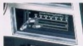
Front air conditioning