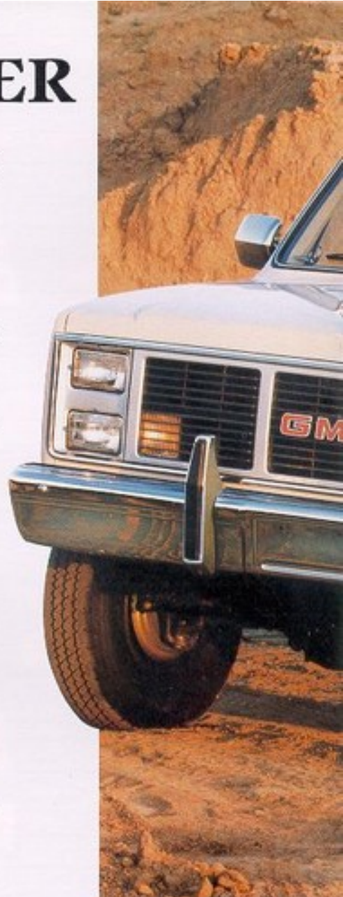
Sierra Classic 4-WD Suburban with exterior decor package and other available equipment

GMC anti-corrosion treatments use rust-resistant steels for many parts of the body and sheet metal. In addition, special Elop-Dip priming coats the entire body. To ward off contaminants, aluminum wax preservative and special sealers are used in critical areas. A special sprayed-on anti-chip coating on lower body areas precedes the finish paint coat of baked-on lustrous acrylic enamel.