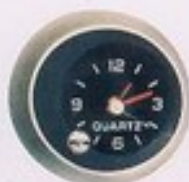
Quartz electric clock