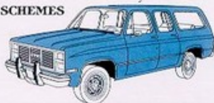
Standard Solid Paint Scheme