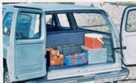
Panel-type rear doors have fixed, tinted glass; opening is 37" high by 59.6" wide. Power door lock available.