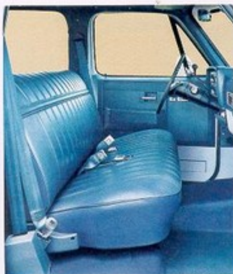
Sierra standard interior comes in Blue or Saddle Tan vinyl.

Beginning September, 1985 nearly 200 senior North Americans are planning to travel the backroads of mainland China on an unprecedented international friendship mission driving GMC Truck Suburbans pulling Airstream trailers.