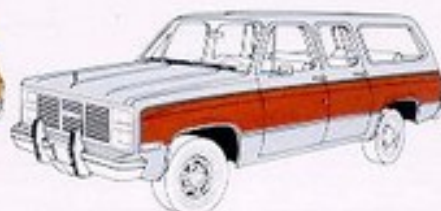
Available Exterior Decor Package