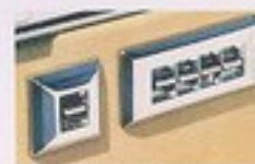
Power door locks and/or power windows