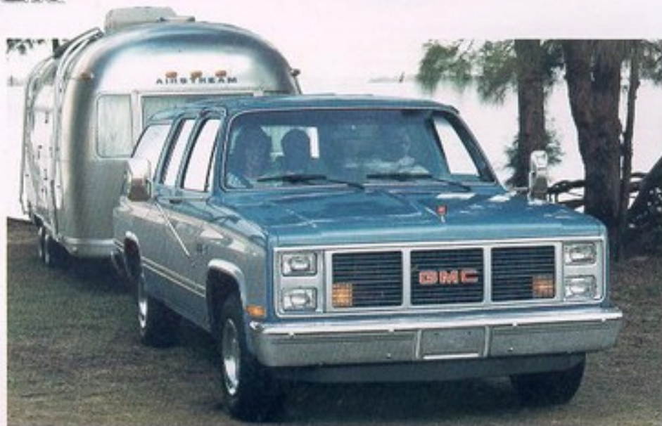
C-2500 Suburban with 7.4 Liter V8 gas engine is in a trailering class by itself! (See below)