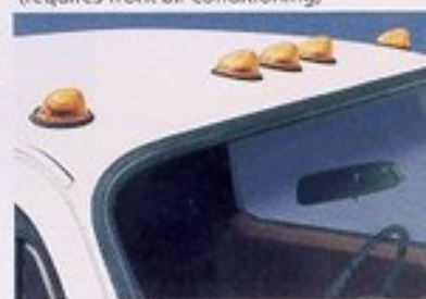
Roof marker lamps