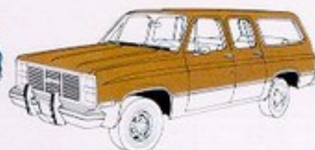
Available Special Two-Tone