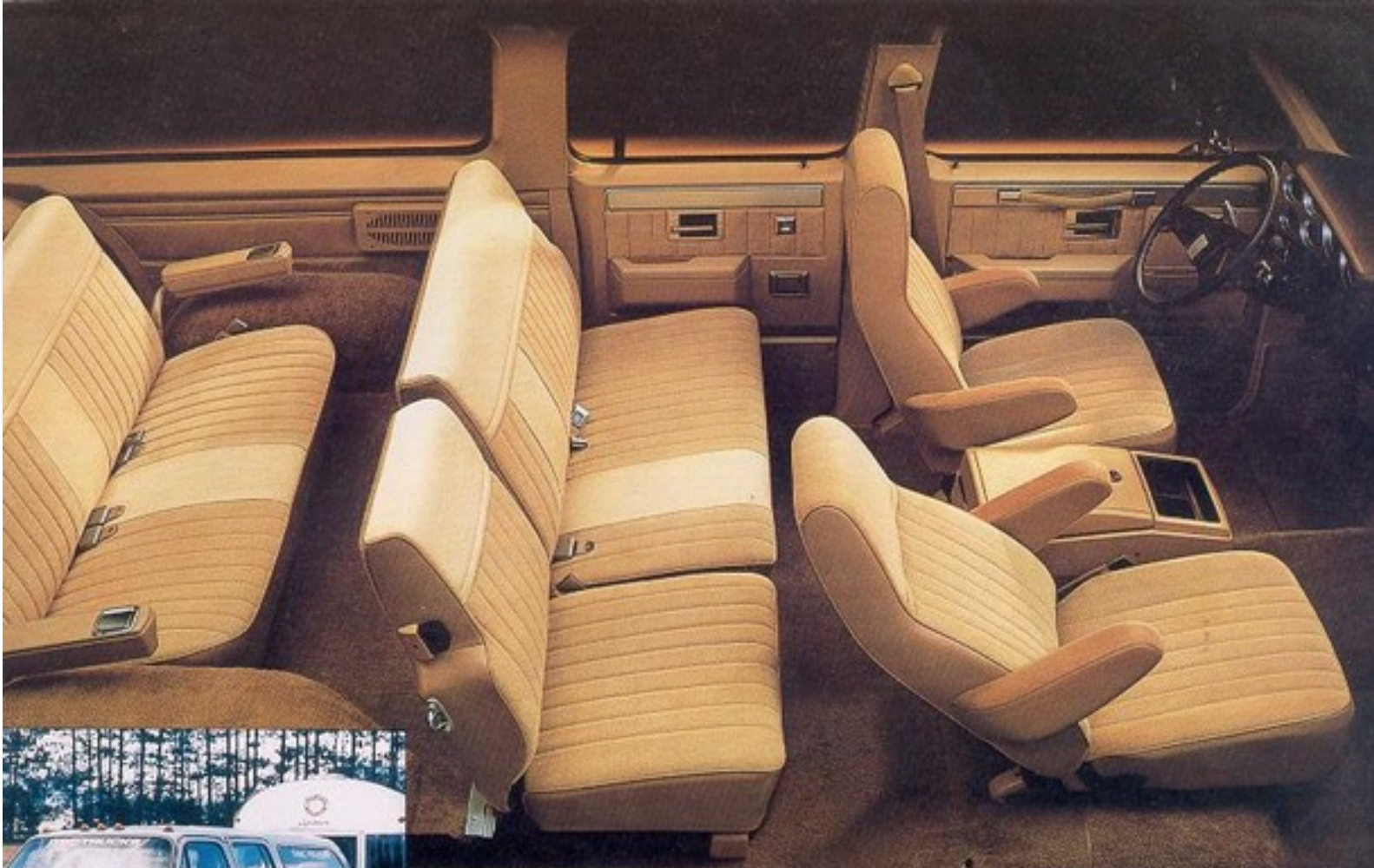
Sierra Classic with available seating