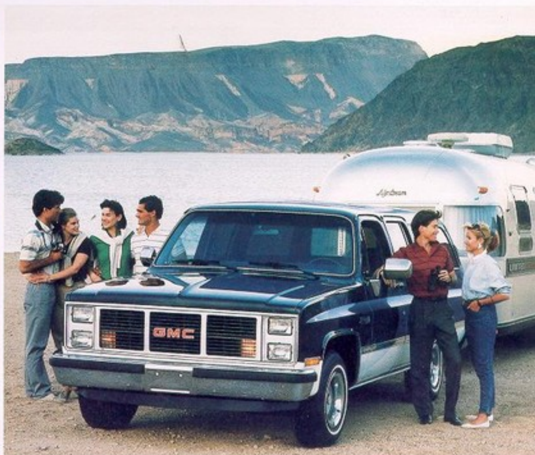
Sierra Classic Suburban with available equipment