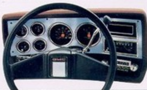
Sierra Classic instrument cluster with needle-type gauges for voltmeter, temperature, and oil pressure