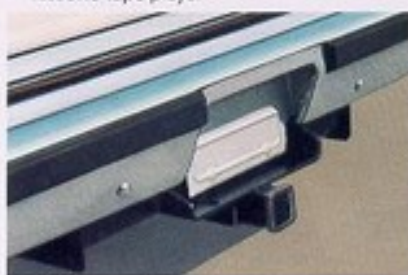
Platform trailer hitch (requires Trailering Special Equipment)