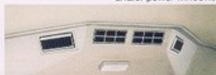
Rear air conditioning (requires front air conditioning)