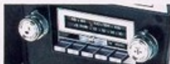
Delco radios: AM, AM/FM, AM/FM stereo, AM/FM stereo with cassette tape player