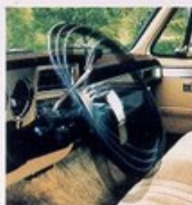
Comfortilt steering wheel

1 - Gross Combination Weight Rating with selected engine and rear axle ratios. Refer to the 1986 GMC Trailering Guide for further information. 2 - Except Series C-1500 in California 3 - Not available in California 4 - Series C-2500 only