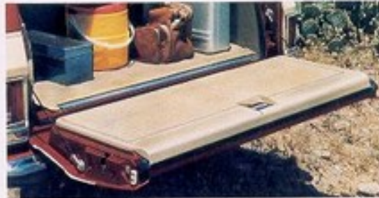
Wagon-type tailgate offers available power drop glass, with or without electric defogger.